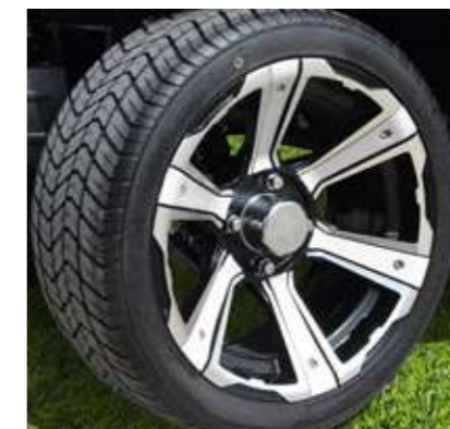
14" ALLOY WHEEL RIMS WITH COLOR MATCHING INSERTS AND RADIAL DOT TIRES