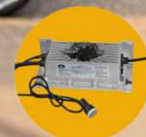
25A Adaptive Charger