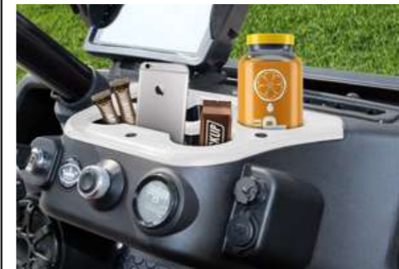
COLOR MATCHED DASHBOARD WITH FOUR CUP HOLDERS/CELL PHONE HOLDER