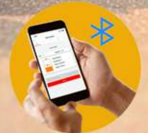
Mobile & PC Live Monitor