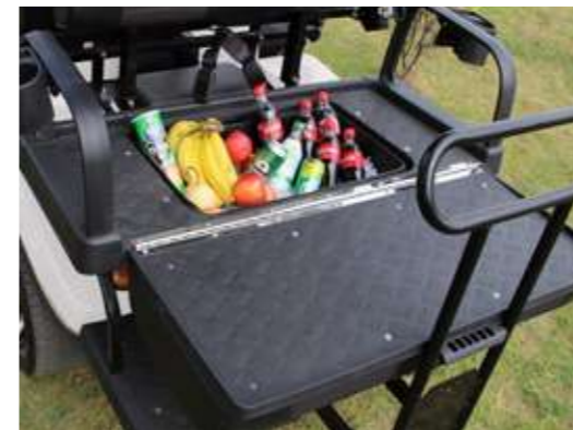
REAR-FACING, FLIP-FLOP SEAT KITS WITH STORAGE COMPARTMENT