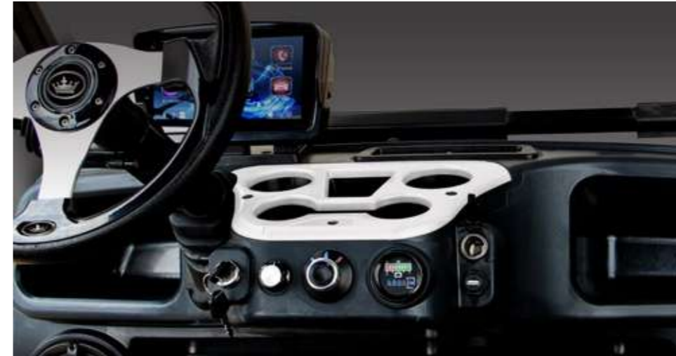
AUTOMOTIVE DESIGNED DASHBOARD, COLOR MATCHED CUP HOLDER INSERT