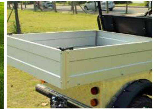
REVERSIBLE ALUMINUM CARGO BOX ( SIZE VARIES BETWEEN MODELS )