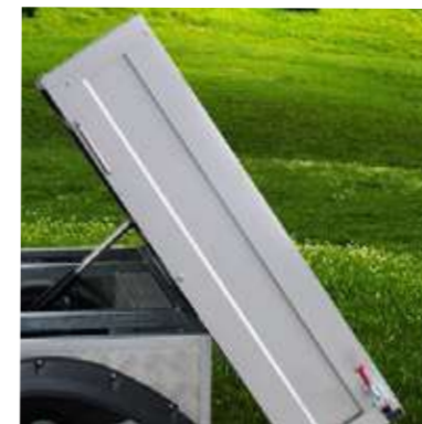
OPTIONAL ELECTRIC TIPPER