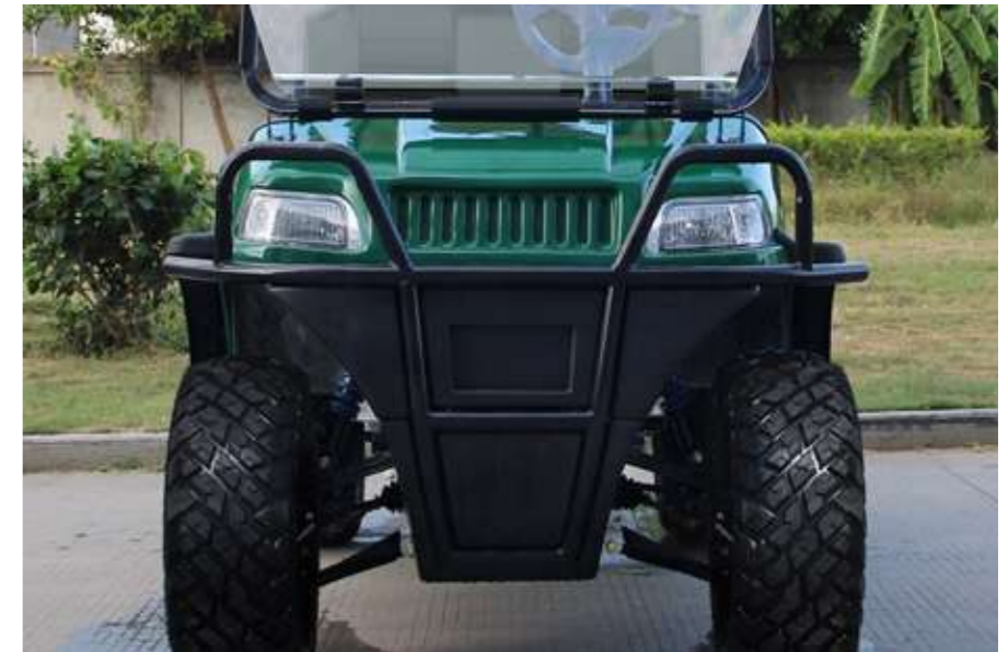
HEAVY DUTY BRUSH GUARD ( TURFMAN 700 ADN 700 EEC )