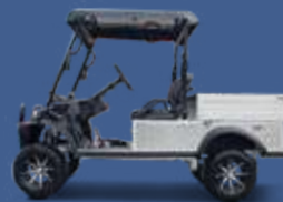
TURFMAN 700 EEC