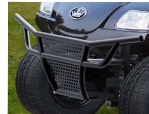
FRONT BRUSH GUARD ( TURFMAN 1000 )