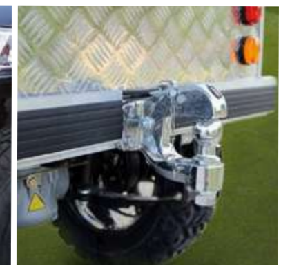
TOWING HOOK ( FOR TURFMAN 700 ADN 1000 )