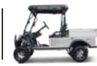
TURFMAN 700 EEC